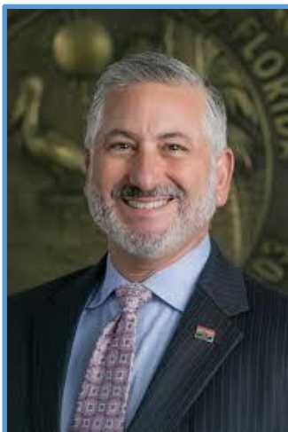
Mayor Rick Kriseman, City of Saint Petersburg